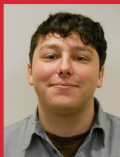
Mitchell Local HelpDesk Pro

SCAN THIS QR CODE FOR THE OFFICIAL ONLINE ENTRY or visit https://signup.com/go/yAkCYeQ