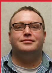
Chad Local HelpDesk Pro