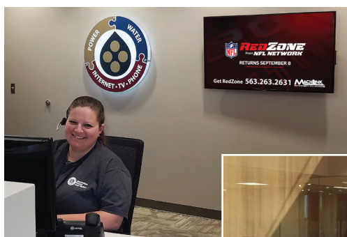
Outside, you'll notice the drive thru window has moved forward about 20 feet. Inside, reception and waiting are now on the right, with inside tellers to the left. A fresh, bright look and improved traffic flow for all.

The two-year SEP designation, recognizes public power utilities for demonstrating leading practices in four key disciplines: smart energy program structure; energy efficiency and distributed energy programs; environmental and sustainability initiatives; and the customer experience.