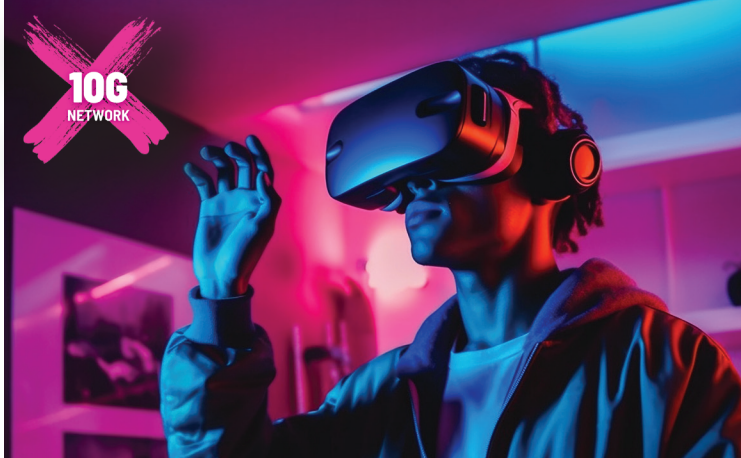
Step into the fastest internet speeds - powered by MPW's 10G Network

We've been hinting at it for weeks and we're excited to launch of 2 Gigabit and 5 Gigabit internet services on our cutting-edge 10G Network just in time for all your new holiday gear!