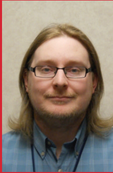
Ben HelpDesk Pro