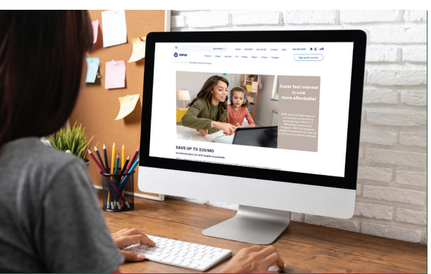
Super fast internet is now more affordable!