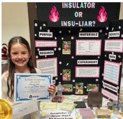
Savvy L - Insulator or Insu-Liar?